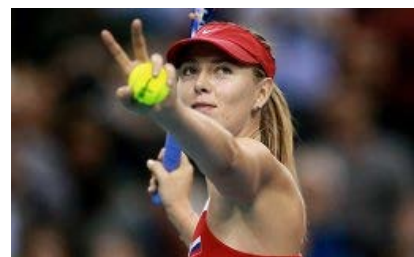
Maria Sharapova Takes Russia to Fed Cup Semi-Finals