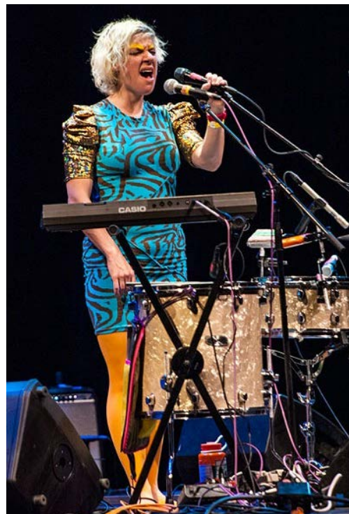
KUTX SECOND BIRTHDAY CONCERT